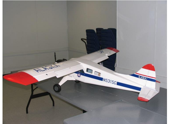
Fitz proud of is subject. Nice job Fitz.