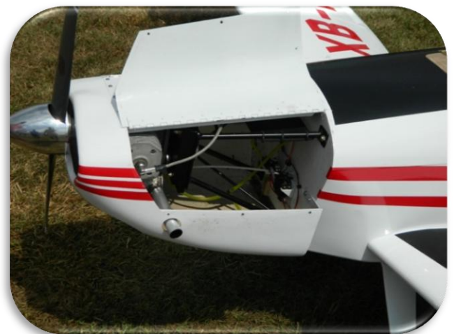
4 – Laredo RC club HUGEEEE AgCat (?)