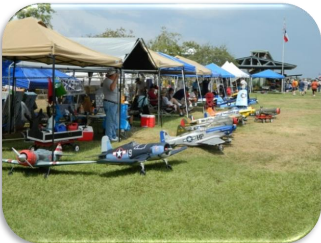
7 – A gaggle of birds