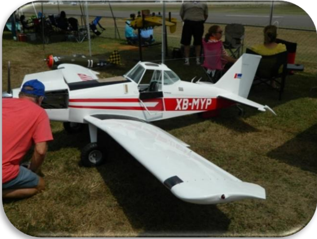
5 – Scale motor mount