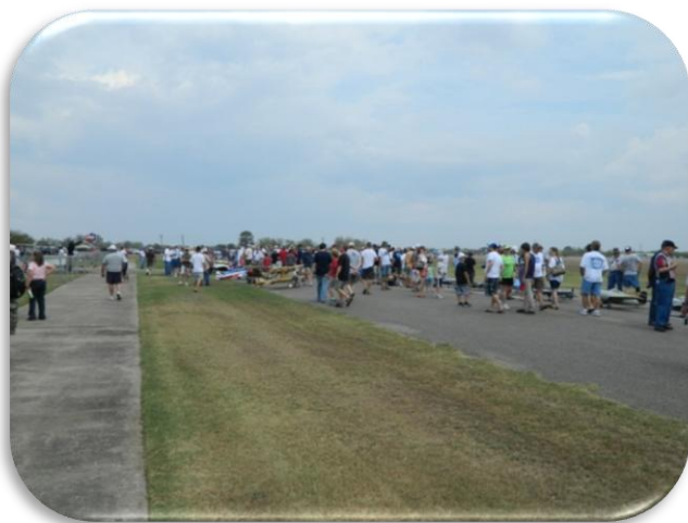
1 – Visitors viewing the planes