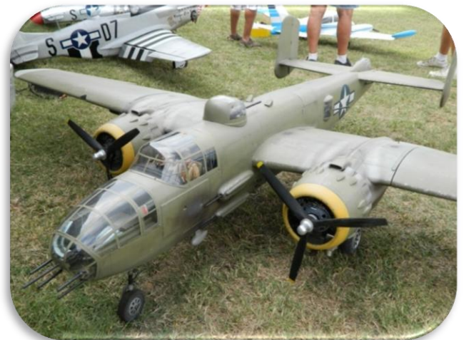
3 – B-25 from the Show Me flight Team

The following pics are a recap of the weekend.