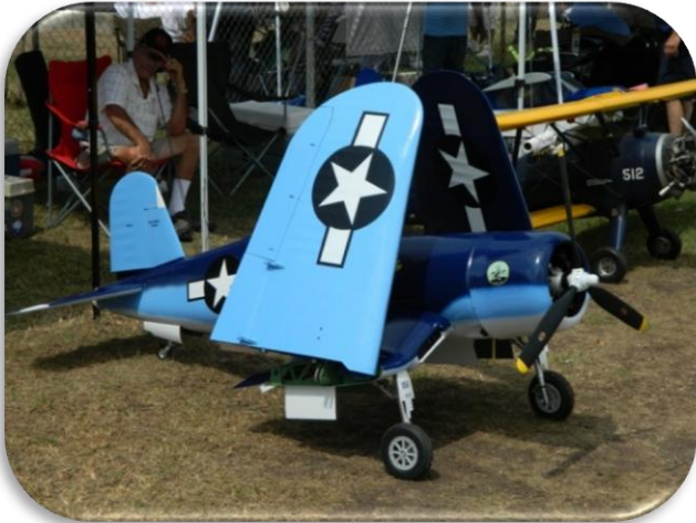
6 – Corsair with folding wings