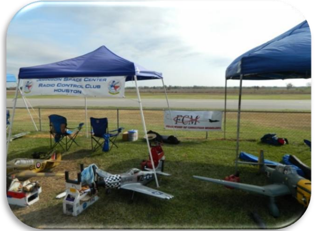
8 – Proud banner of JSC RCC