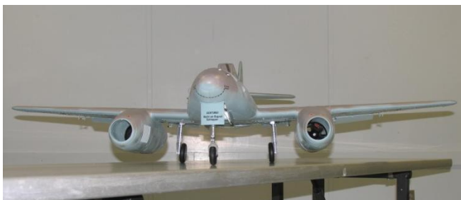
Now that looks intimidating.