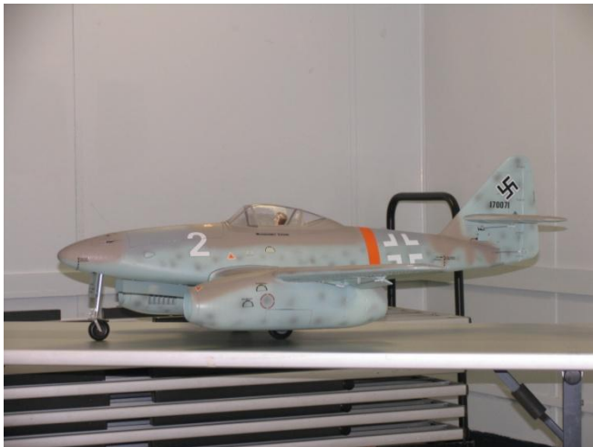
A side view of the nice model