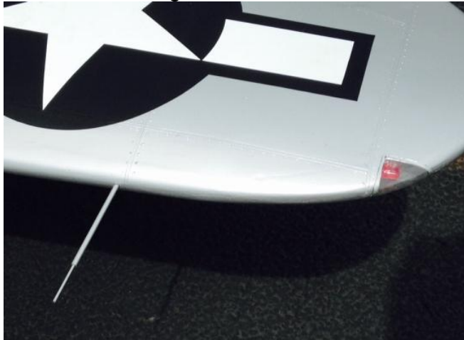
Some of the detail.

pressure problems. Even dropped my bombs on the second flight, looked nice.