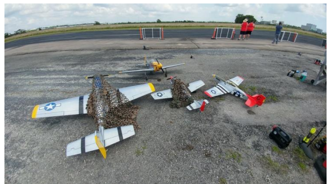
Some mustangs under cover.