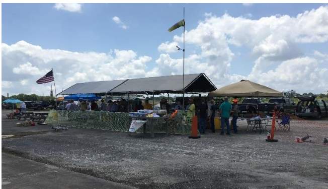
Everyone gathering up to pick up their Jimmy Johns.