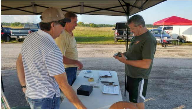
Pilots are signing up.

The pic below is the national anthem and the flag fly by. Another outstanding job.