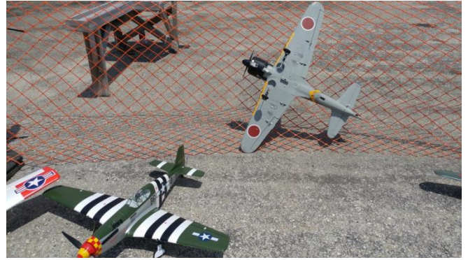
This pic illustrates the wind gust. Sometimes we had a fairly good cross wind. But the pilots prevailed. All JSC members were wondering what the big deal was. : ' )