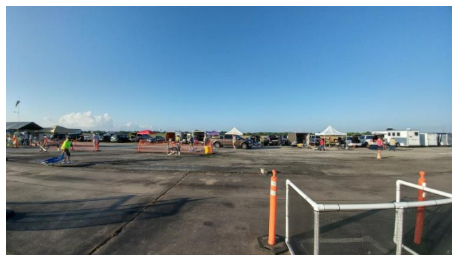
Field is looking good and pilots are arriving.