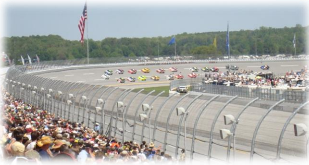
Around turn four.

This first pic is everyone listening to a few opening comments.