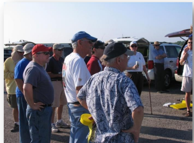
Now for the ribbon cutting.