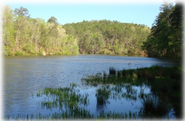
A view from our hotel window.