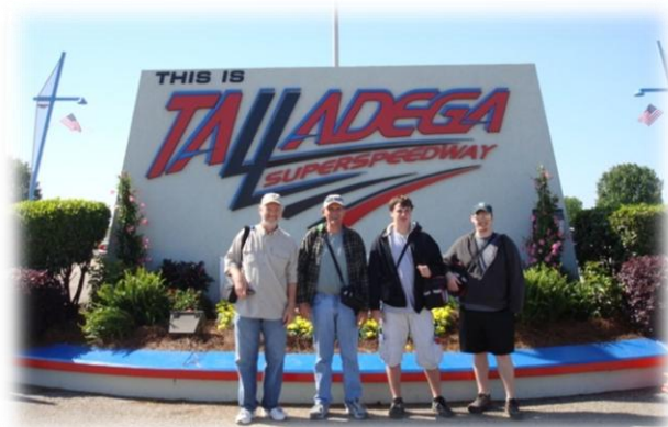
The four thugs in front of the main entrance sign.

You may have noticed I missed the last meeting. The reason I missed the meeting is I had a chance to go to the NASCAR Aaron's 500 at Talladega. I went with my brother-in-law and his two sons. All I can say is what an awesome display of power. I am not a big NASCAR fan but just wanted to see what it was all about. I was not disappointed.