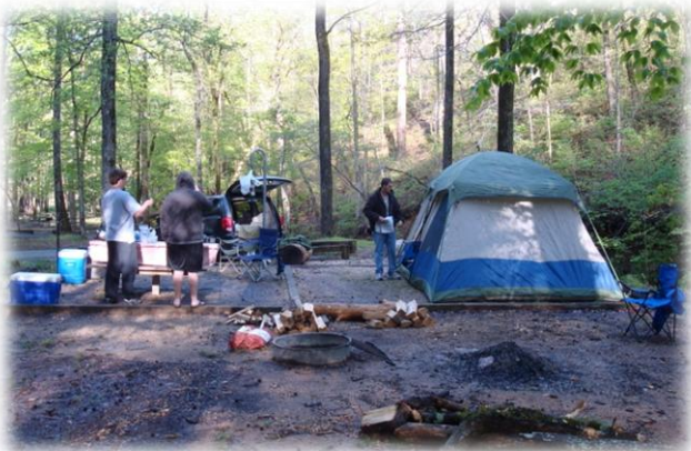
Our lovely hotel accommodations.