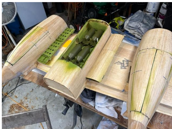
Bomb rack in the B-25 bay, nice fit.

from Hobbyclub.com, Article in upcoming issue of Model Aviation