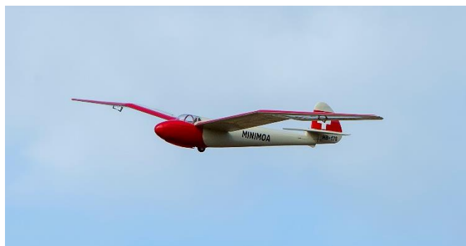
What a nice pic. I feel like I'm in it. Minimoia 1/6th scale. 112" span, all wood laser cut kit